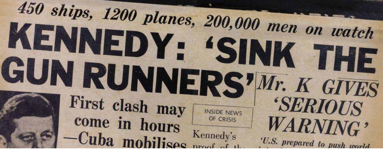
The Cuban Missile Crisis is the subject for research on Latin American perspectives of the Cold War. —The front page of the Evening Standard, October 1962