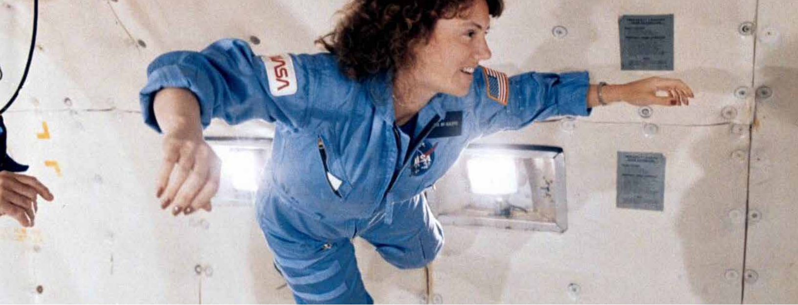
An archive in New Hampshire preserves its resources related to Teacher in Space Christa McAuliffe, who was killed during the Space Shuttle Challenger tragedy in 1986.