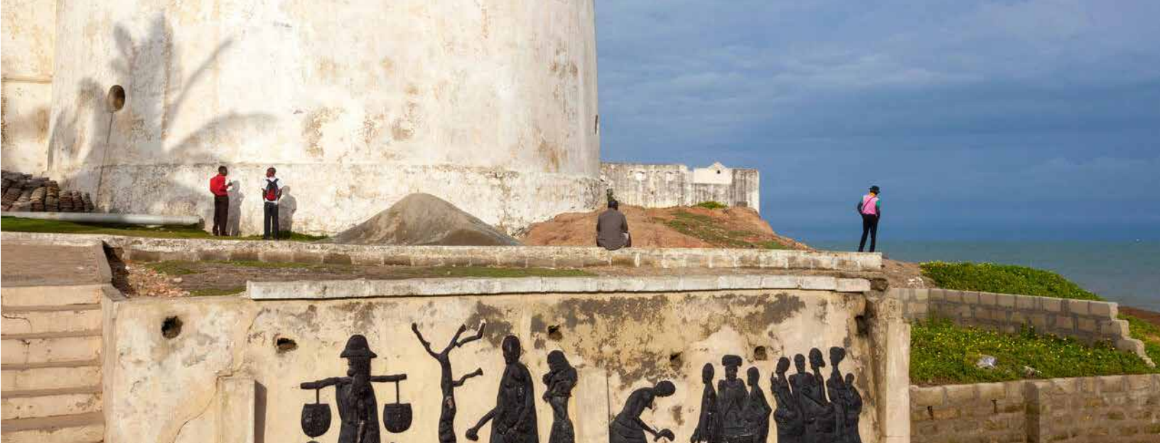
Cape Coast Castle in Ghana, a hub of the transatlantic slave trade, becomes a virtual reality experience through a grant to Indiana's Purdue University.