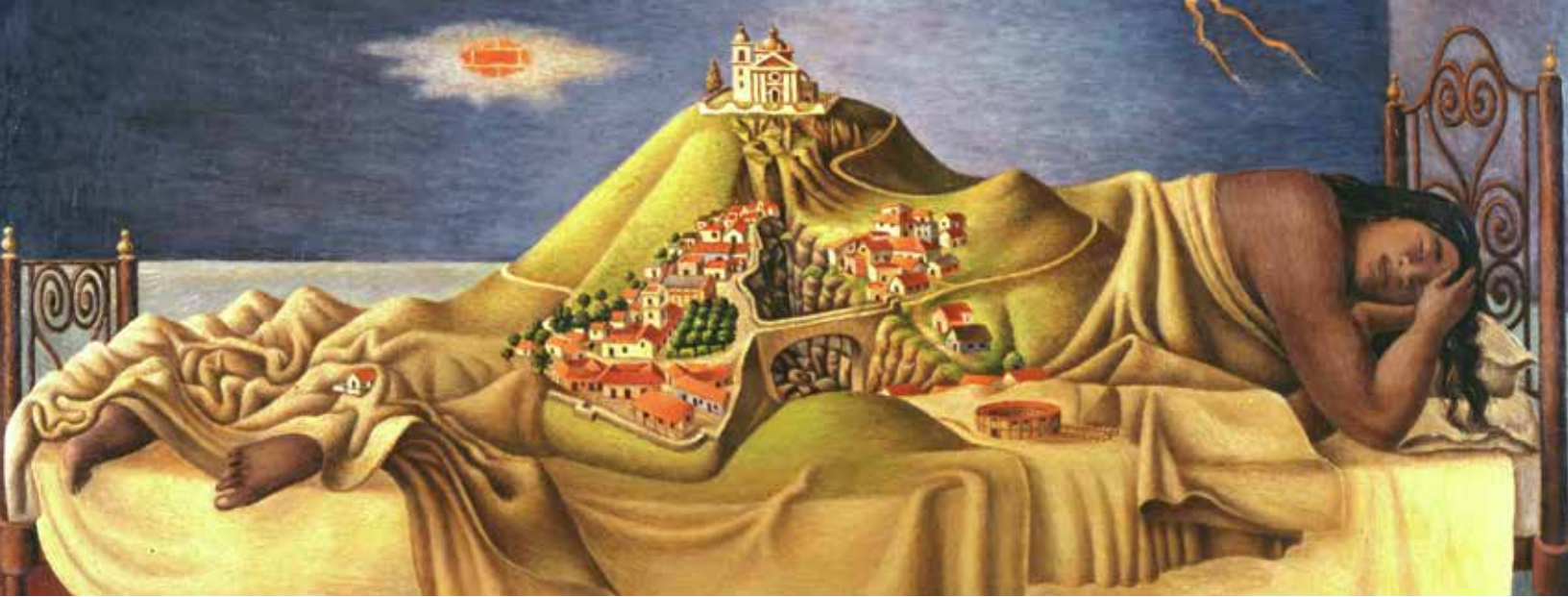
NEH supported an exhibition on La Malinche, the Indigenous interpreter for the Spanish conquistador Hernán Cortés. —El sueño de la Malinche ( Malinche's dream), by Antonio Ruíz, 1939